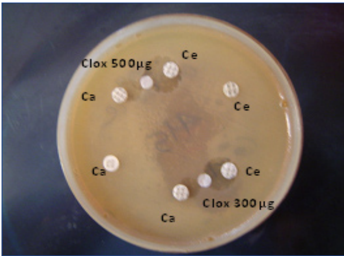
[Table/Fig-1]: Double Disc Synergy Test (DDST): • Ce (alone): cefotaxime (30µg) disc showing no zone of inhibition . • Ca (alone) : ceftazidime (30µg) disc showing no zone of inhibition • Ce-clox -Ca : cefotaxime (30µg) – cloxacillin (500µg & 300µg) :- ceftazidime (30µg) showing synergistic action of ce and ca towards cloxacillin disc